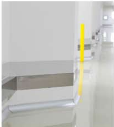
The factory walls and floors are designed so that all dust can be quickly removed.