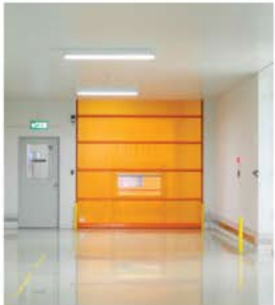
All doors of the factory are automated double- or more interlocking shutter doors.