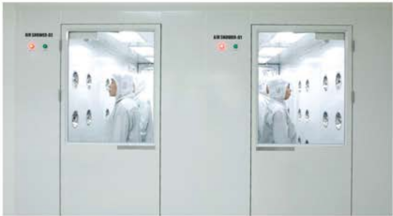
Whenever entering the factory, every person passes through an air shower to receive strong wind from head to foot for anti-dust purposes.

Our dedicated design team professionally supervises data provided by customers. From pattern fitting with high accuracy, as well as the toning process using our state-of-the-air printing machines (10-color / 8-color), your package design will be vividly realized.